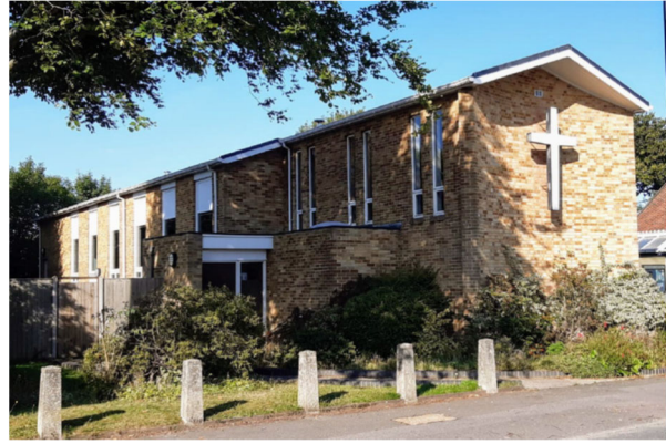
St Antony's Church Hamsey Green