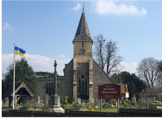
All Saints' Church Sanderstead