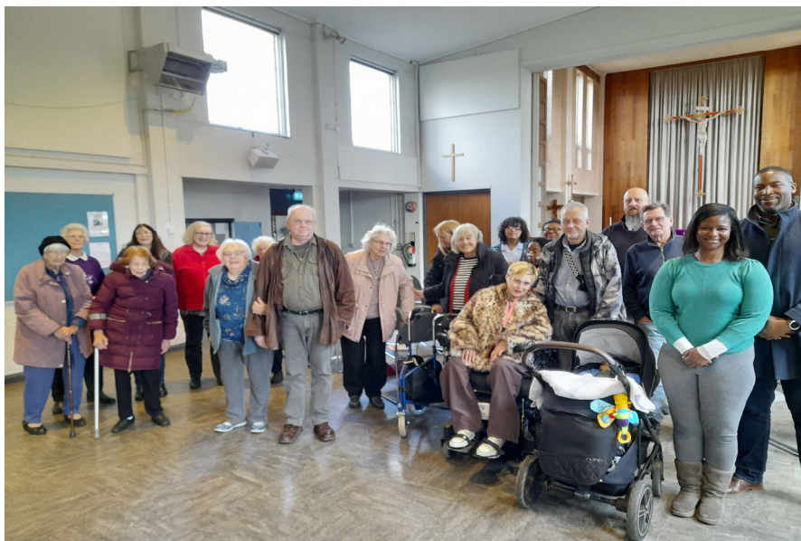
Photo taken and used with kind permission by all in the photograph.

The purpose of St Antony's is to be God's presence here in Hamsey Green.